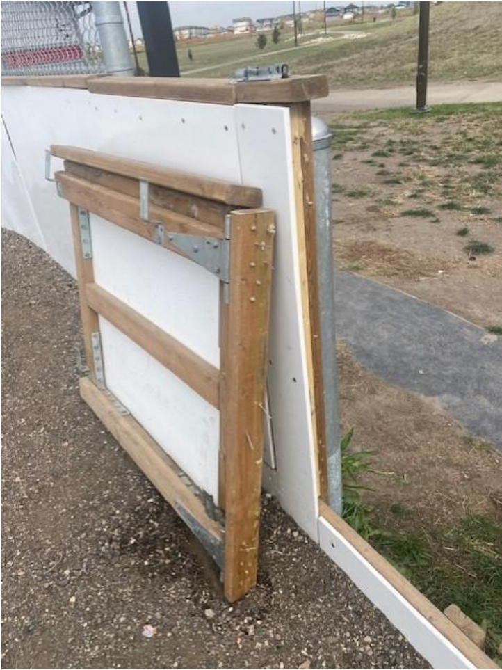
Vandalism at the Rink: