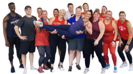
Functional team training coached by certified personal trainers